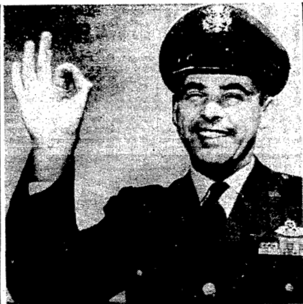
SPACE CHASER —Maj. Robert White gives OK sign after flight in experimental X-15 rocket plane which carried him to new world record of at least 2,650 miles an hour. Flight at half throttle was so fast friction caused thermal paint to blister on nose and tail of plane. Maximum effort flight intended to carry X-15 at least 100 miles toward space is expected this summer.