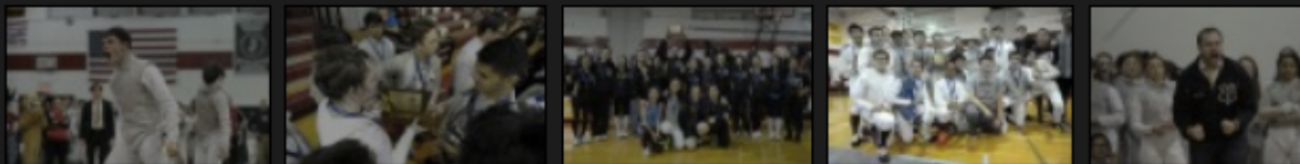
Members of the St. Peter's Prep boys fencing team celebrate a win over Columbia in the NJSIAA boys fencing team tournament final Feb. 22, 2017, at Morris Hills High School in Rockaway, New Jersey.