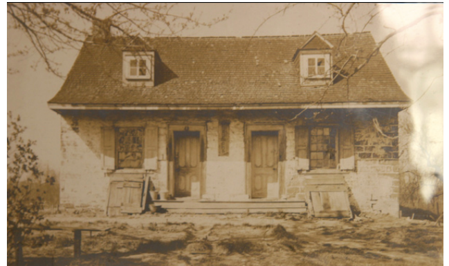
Demarest HS back then.