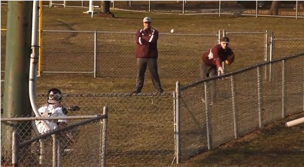
Pitchers & Catchers

Set each video to 720 HD and Full Screen