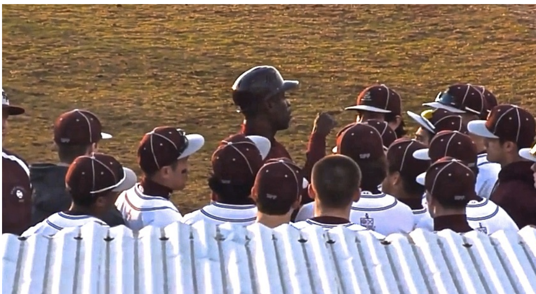
And the Game Begins