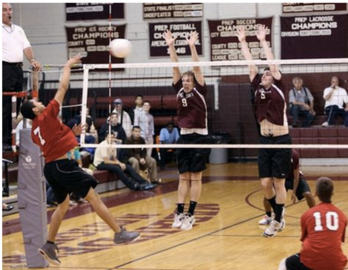
St. Peter's Prep