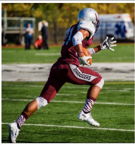
Minkah Fitzpatrick CB/WR/RB