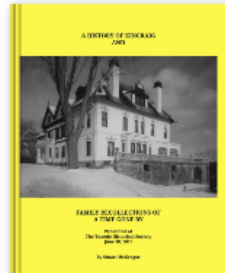
A History of Kinraig and Family Recollections of a Time Gone By