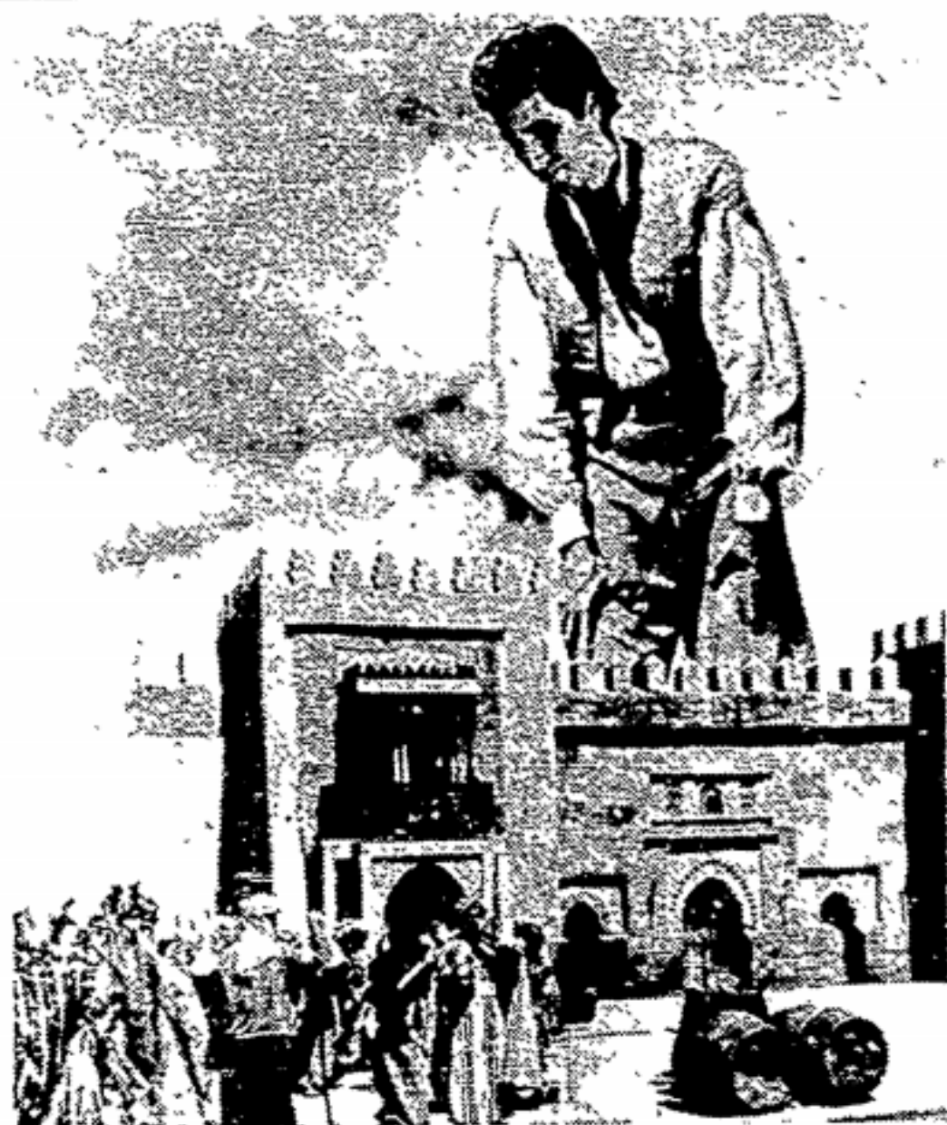
DUE AT LOEW'S —Gulliver, played by Kerwin Matthews, towers over the Lilliputians in "The Three Worlds of Gulliver" in color, starting Friday at Loew's Jersey City Theater. The film co-stars Jo Morrow and June Thorburn. On the same program is "My Dog Buddy."

e n k e t i n s y y y y y y p l s y y e t o n d t