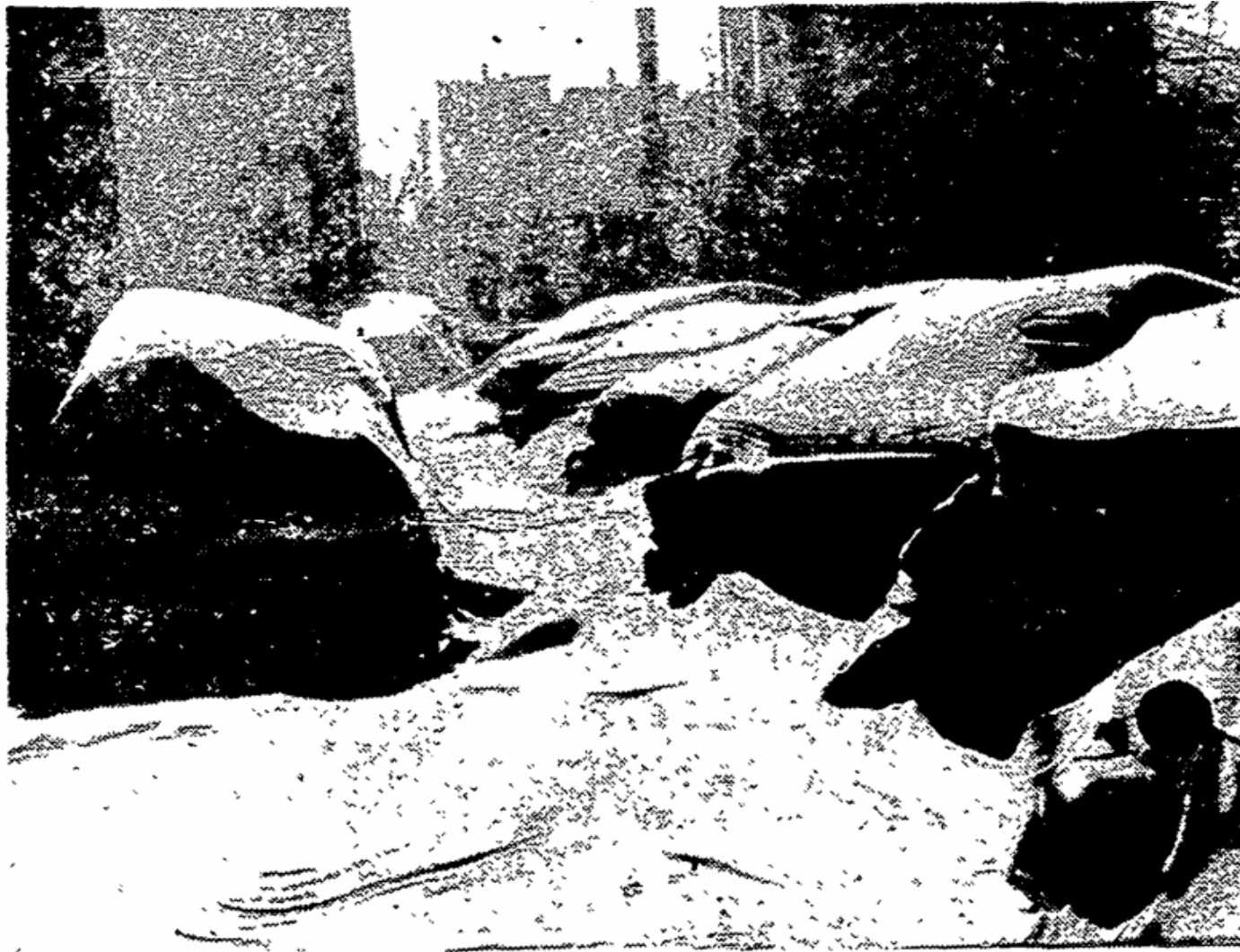
MODERN ART? —The winds sculptured these snow-capped cars into abstract forms in a Newark Avenue parking lot yesterday.