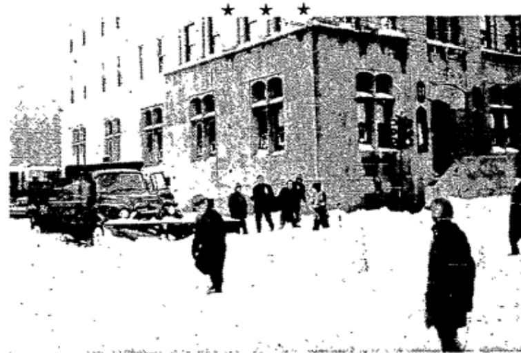
EMERGENCY JOB—A snow plow of the Hudson County Road Department clears an area at the St Joseph Home for

the Blind, Jersey City, to permit an oil truck to make an emergency delivery to the institution.