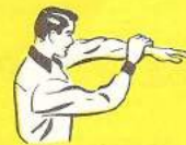
HOLDING SIGNAL FOUL—GRASP WRIST