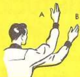
TIME OUT (CALLED) A—TO STOP CLOCK B—SUBSTITUTE MAY ENTER