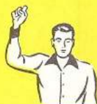
TIME OUT (WITH FOUL) FOR DOUBLE FOUL ALSO POINT AT EACH BASKET