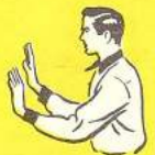
PUSHING, CHARGING SIGNAL FOUL— IMITATE PUSH