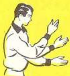
TIME IN CHOP WITH HANDS OR FINGER