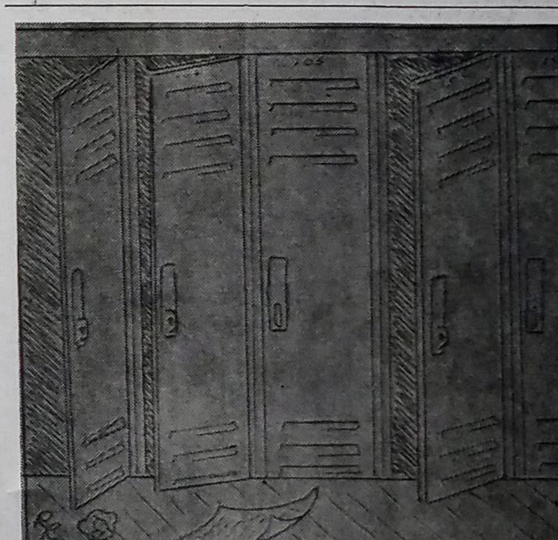
The sound of silence.