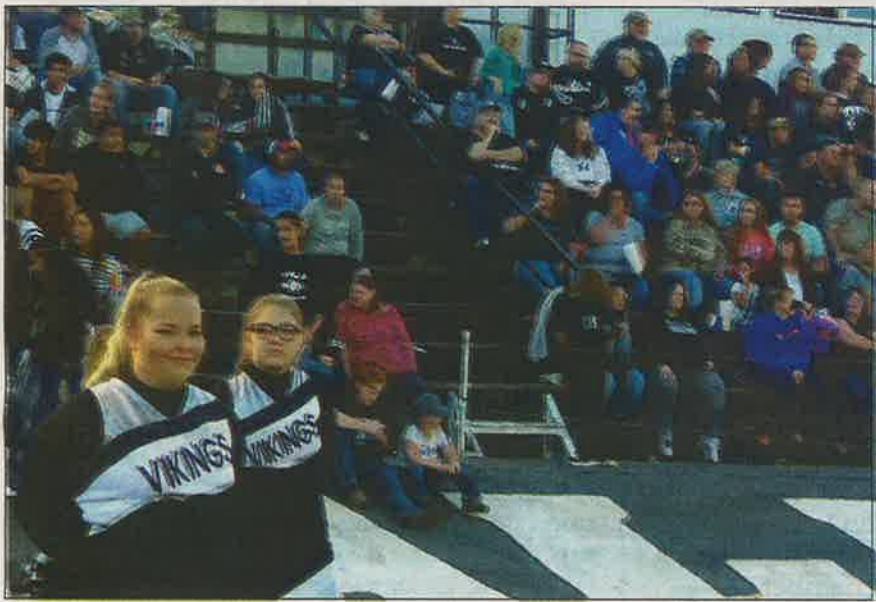
Above: Vale cheerleaders rally the spirits of the crowd. Below: Local ranchers and farmers are honored by the student body at a school assembly during homecoming week.