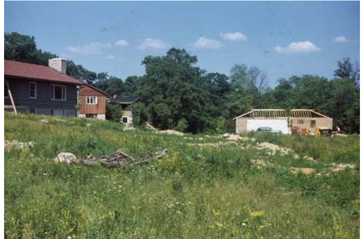
The Village Under Construction