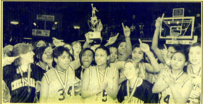
The Girls' Basketball Team celebrates their District I Championship victory.