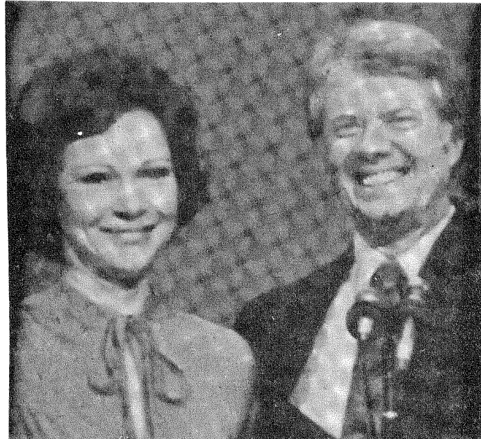
The Carter's announce plans for Amy to attend Gunn