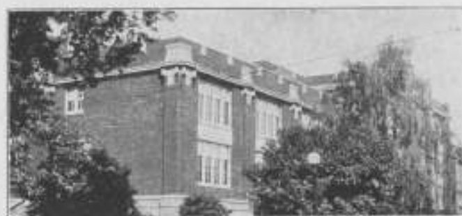
CENTRAL JUNIOR-SENIOR HIGH SCHOOL South Bend 1, Indiana