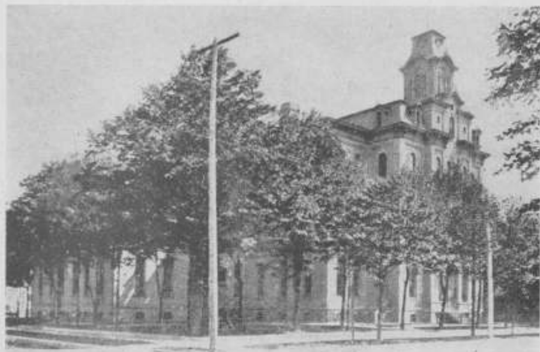
THE "NEW HIGH SCHOOL" — 1873

After six years the citizens of South Bend purchased the Seminary for $1516, to be paid in ten installments, and it became the first high school in South Bend. In 1872 the Seminary was razed to make way for a larger building needed to care for the increased enrollment. South Bend High School classes were then held temporarily in the old Madison grade school building while a new high school building was being erected on the site of the old seminary. The "new high school," pictured below, was completed in 1873 and was referred to as "one of the handsomest school buildings in this part of the state" by Alfred B. Miller in an editorial in the South Bend Tribune of April 20, 1872.