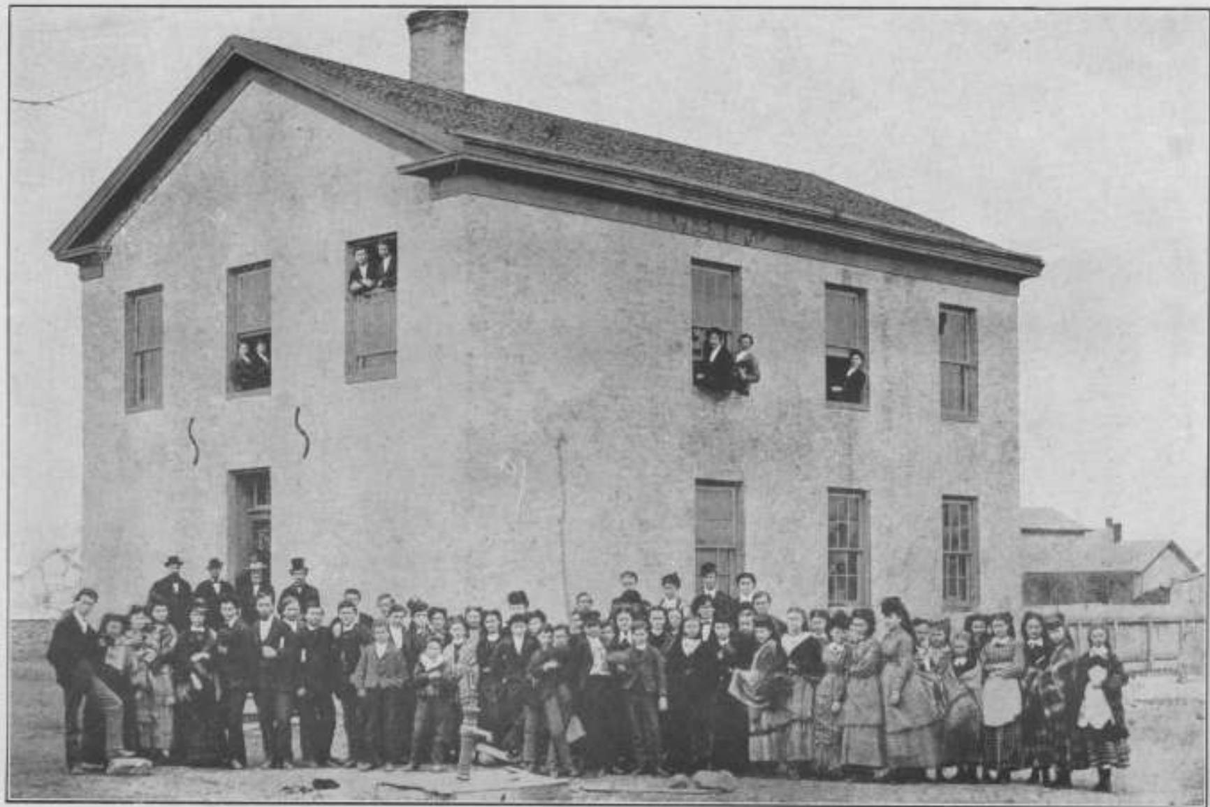
THE ST. JOSEPH COUNTY SEMINARY 1845-1872