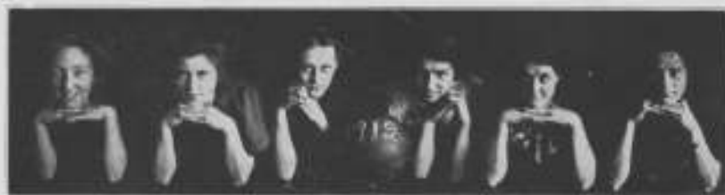
A SHY JUNIOR GIRLS' BASKETBALL TEAM — 1911