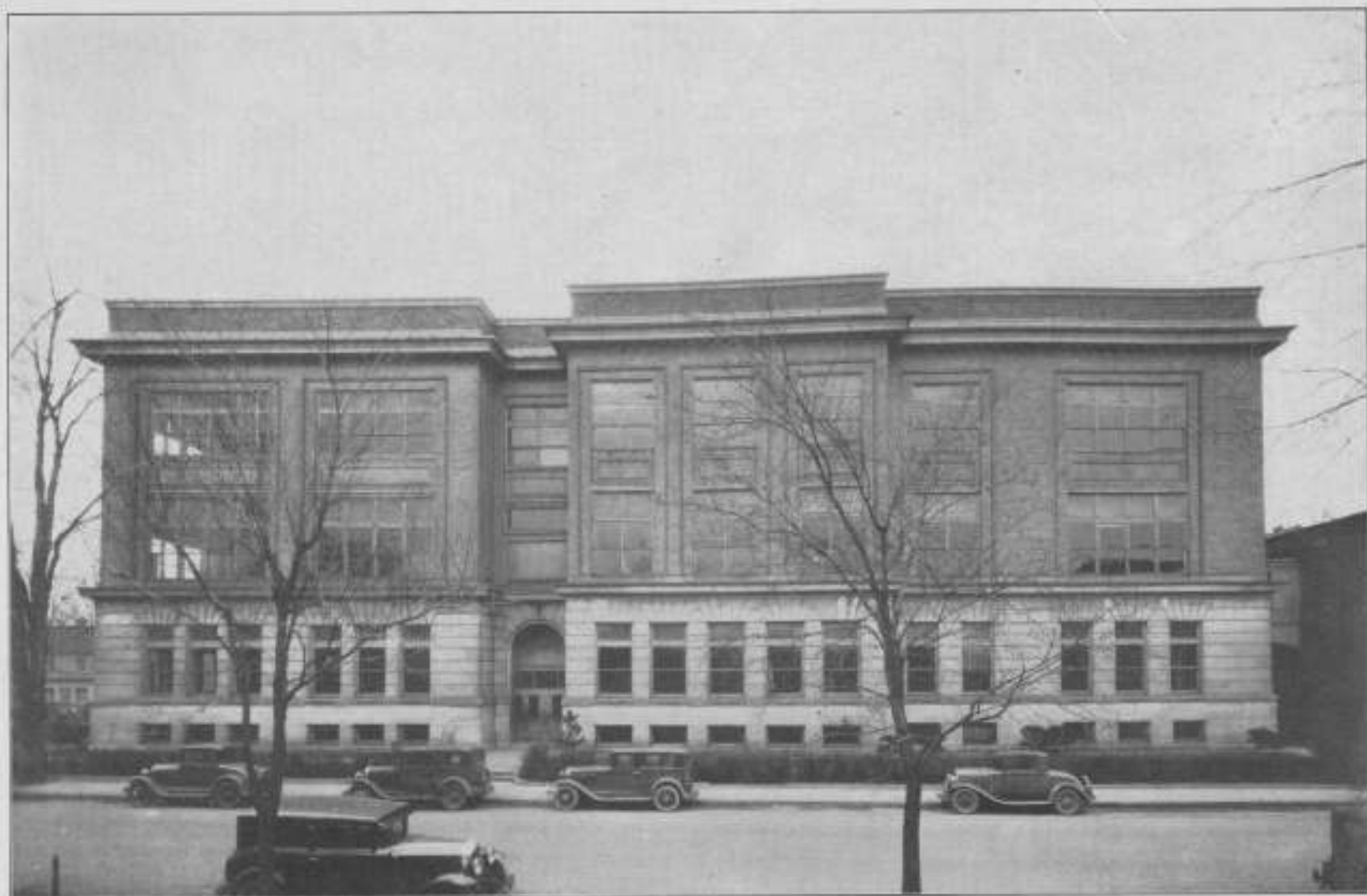
WILLIAMS STREET ADDITION TO THE 1905 HIGH SCHOOL

The 1905 high school building soon failed to adequately house all of the high school students of South Bend and additional rooms were added to the south as seen from the Williams Street side.