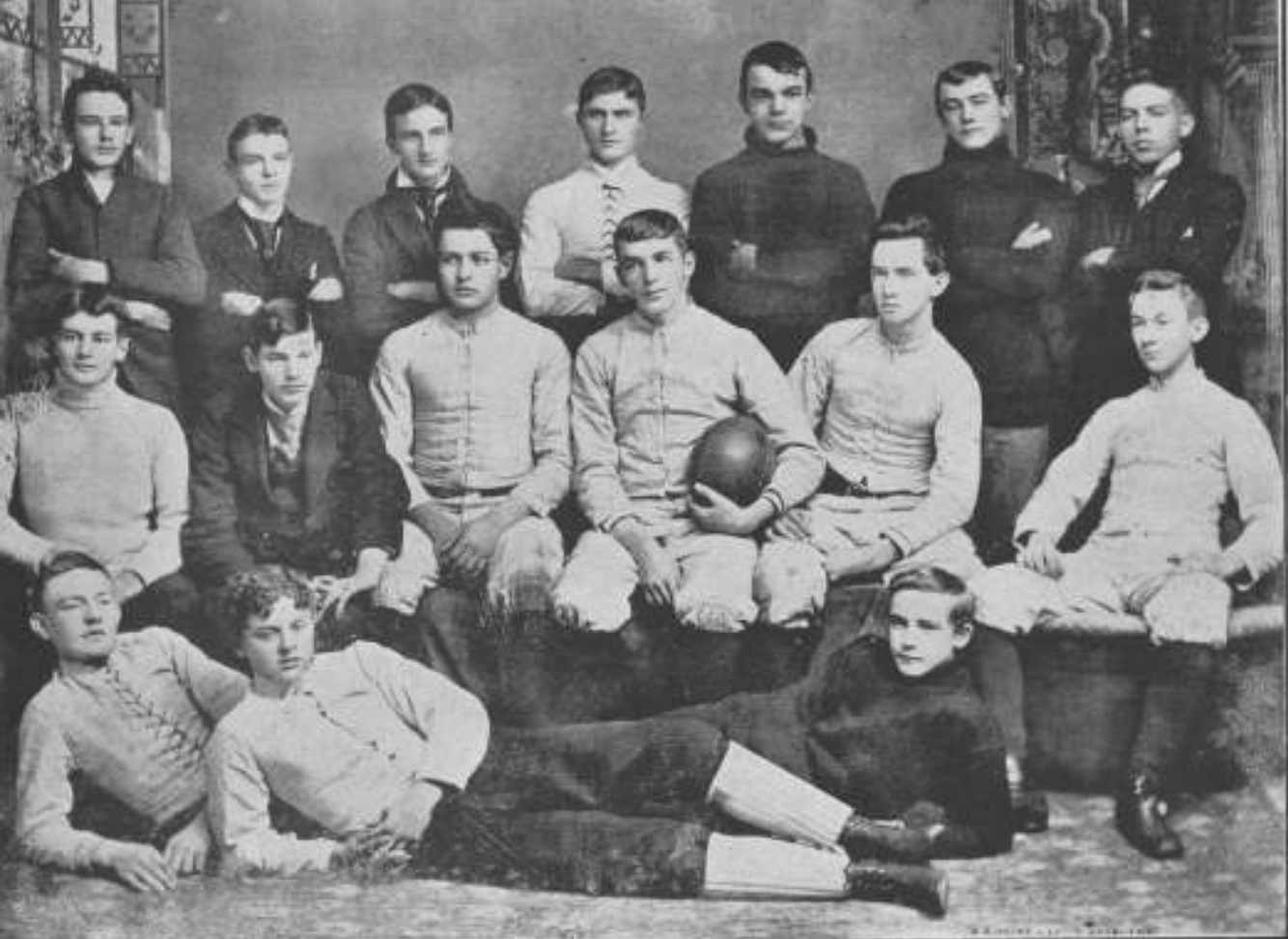
FOOTBALL TEAM, 1893-1894