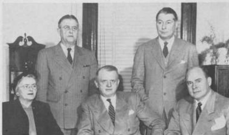
THE BOARD OF EDUCATION SOUTH BEND PUBLIC SCHOOLS 1950-1951