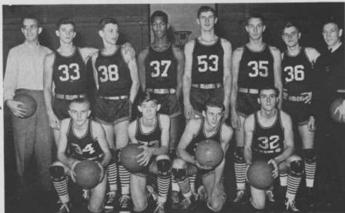
THE 1940-1941 VARSITY

The finals scores for 1913—S. B. 29 - Decatur 2; S. B. 26 - Seymour 6; S. B. 29 - Shortridge 11; S. B. 16 - Gary 8; S. B. 19 - Crawfordsville 11; S. B. 14 - Wingate 15.