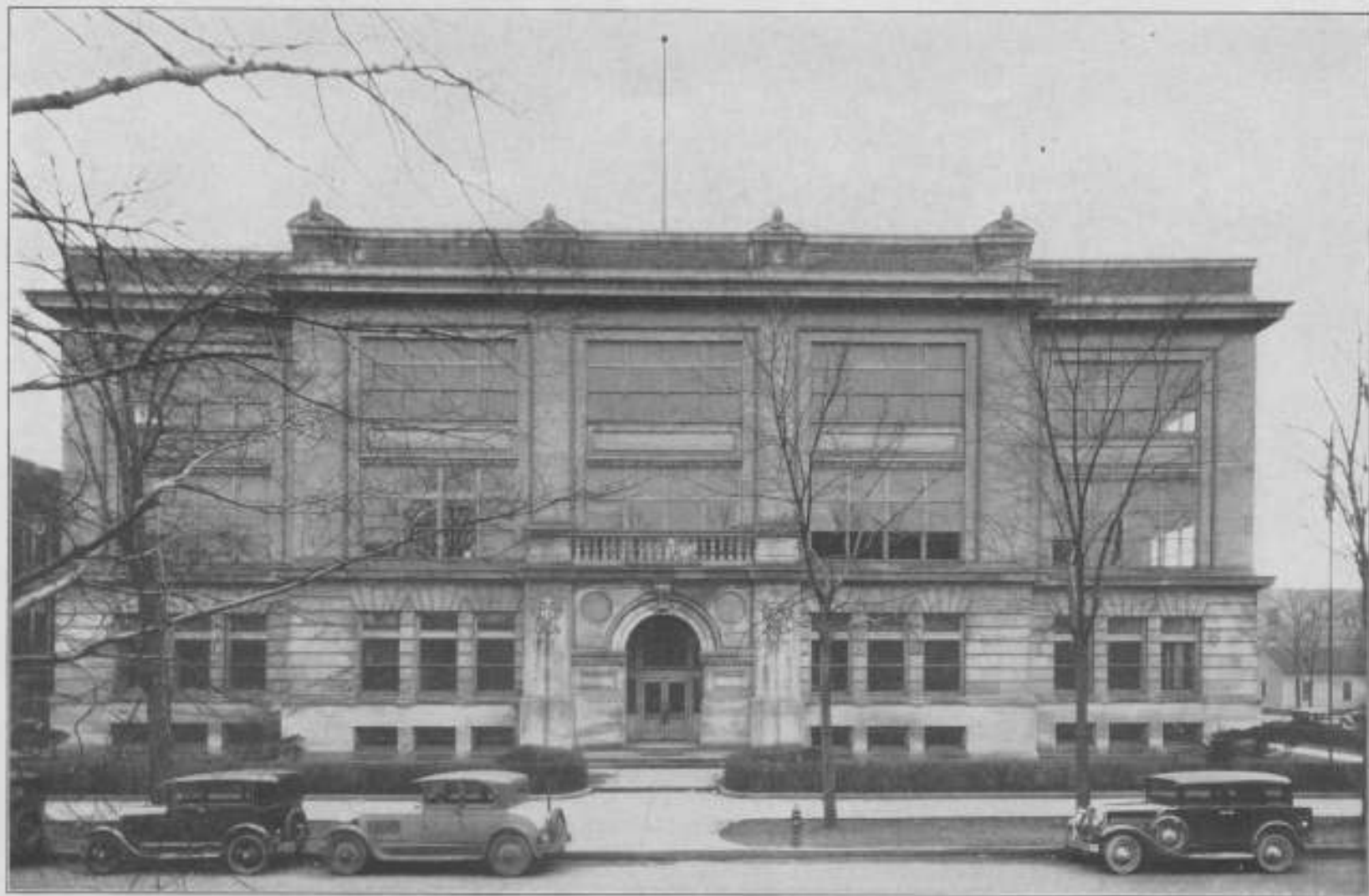
A NEW SOUTH BEND HIGH SCHOOL IN 1905

Additions to and subdividing of the classrooms in South Bend's 1873 high school building failed to care for the increasing attendance and in 1905 the structure shown above, viewed from Colfax Avenue, was started.