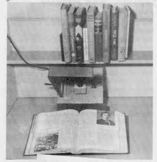
This is one of the reading machines recently received by the English Departments.

To the Ushers Club, for maintaining order at games.