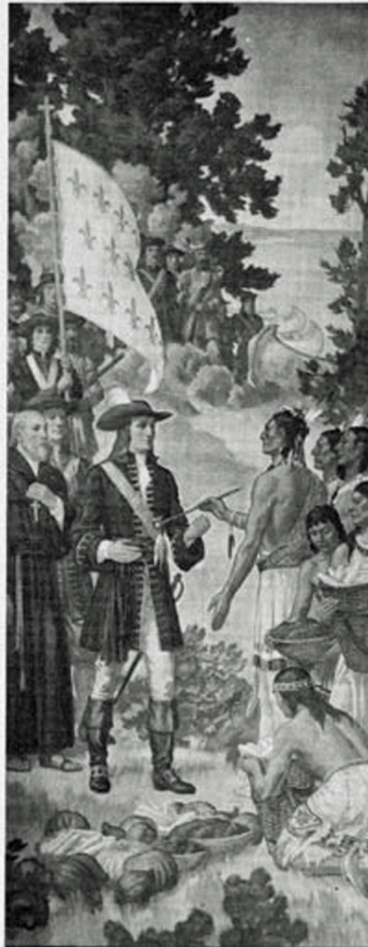
CARTELLIER SEUR DE LA SALLE AT THE BEGINNING OF HIS HEROIC EXPLORATIONS OF THE NEW WORLD LANDED AT BRONDFQUOIT BAY IN THE YEAR 1669.