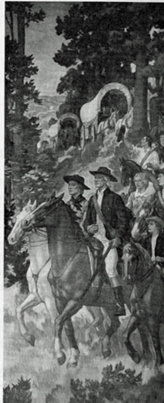
IN THE YEAR 1800 COLONEL NATHANIEL ROCHESTER CAME TO THIS LOCALITY WITH DEEP PIONEER FAITH HE ENVISIONED A GREAT CITY IN THE GENESSEE VALLEY

Installed May 11, 1938 — Monroe High School Auditorium