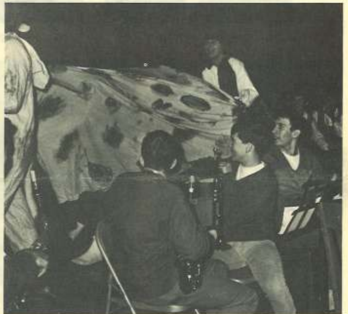
Rousing parade urges students to attend TOLO Dance.

The festivities will come to a close at 11:30.