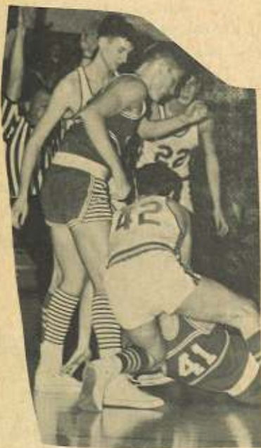
Joe Trapper to the rescue! (OLE PHOTO)