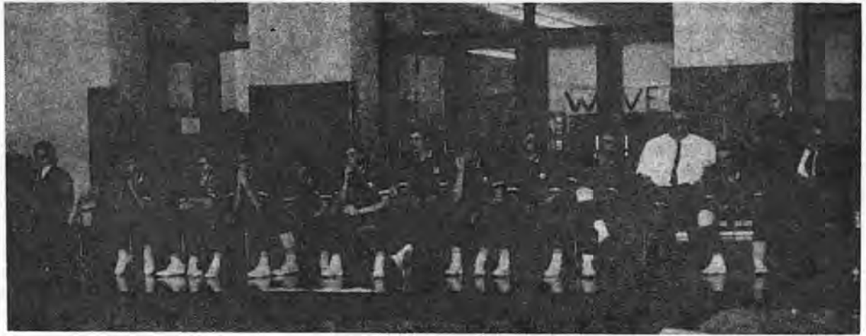
JACKSON'S MAT SQUAD watches as one of its members competes in a recent meet. The Tigers ended the season with consecutive victories over Concord, North Liberty, and LaVile. After the LaVile meet, the Tigers were treated to dinner by the host LaVile team.