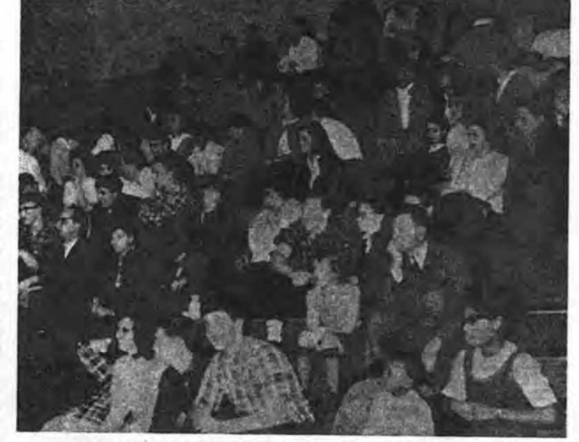
ALTHOUGH THE YOUNG ATHLETIC TEAMS of Jackson have not been consistent winners this year, the spirit of fans has remained high. If you are in this crowd, shown at a recent wrestling match in the Riley gym, you are doing your part to back the Tigers.