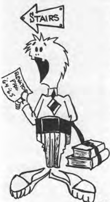
Being a freshman.