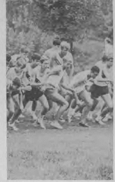
MASS CONFUSION? No. It's the start of a cross country meet.

The first three teams and the first five individuals are qualified to run in the regionals tomorrow at LaPorte.